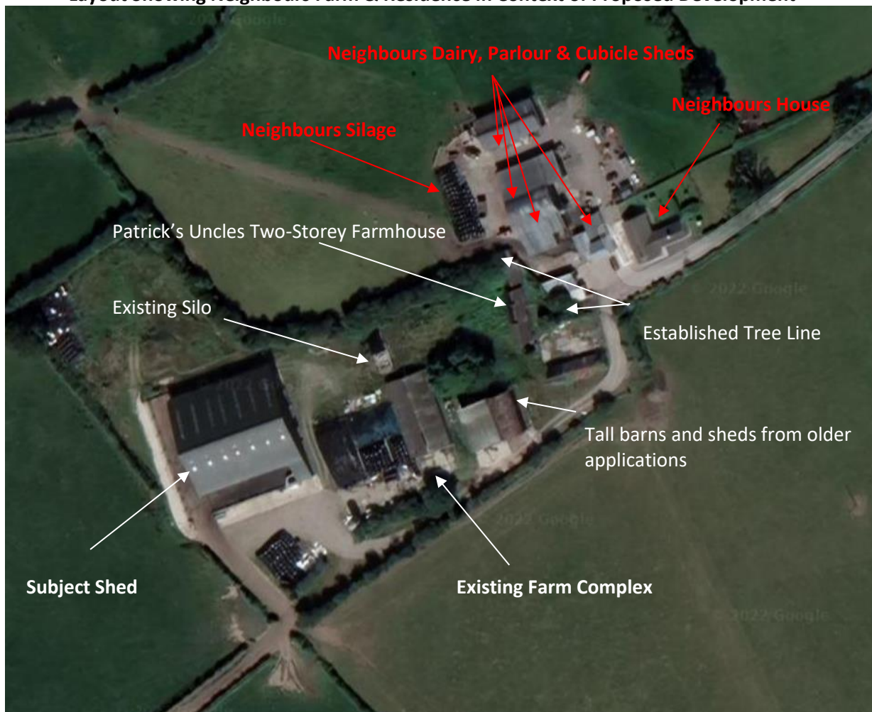
Layout Showing Neighbours Farm & Residence in Context of Proposed Development

8.3.2 During consultations with regard to the design of the new shed, it made sense from an agricultural and best farming practice to consolidate facilities at this location. Given that the applicants did not know that planning was even required for the shed and having regard to the existing facilities at this location, there was no doubt in their minds that this was the best site upon which to locate the subject development.