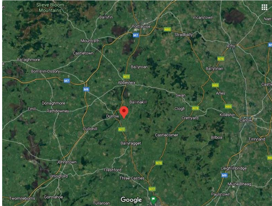
Site Location in Red